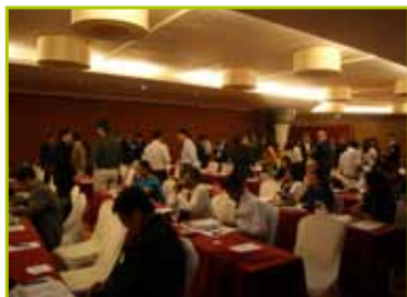
Speed Networking Session