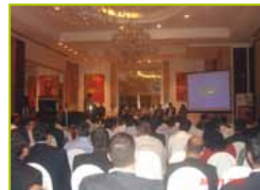
DAY 2 Ballroom