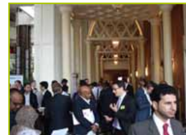
Morning Refreshments at the Foyer