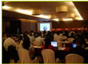
Summit Day 1