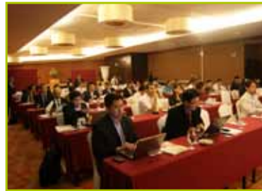
Summit Day 1 - Crowne Plaza Ballroom