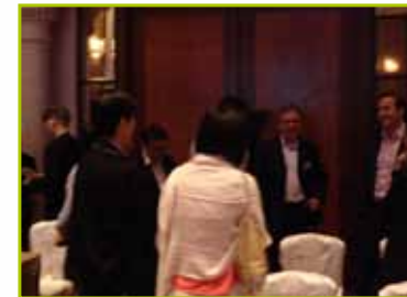
Breakout Group Discussion - Morning