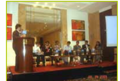
Panellists on Stage