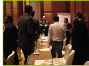
Breakout Group Discussion - Afternoon