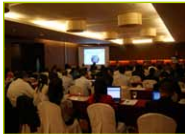
Summit Day 1