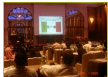
Keynote Speaker's Address

Mobile Payments & NFC World Summit 2009 1 - 2 April 2009, Kuala Lumpur, Malaysia