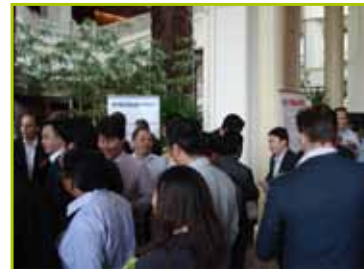
2011 Event Sponsors - Megapay & Netbiscuits