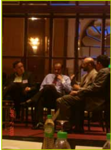
Interactive Panel Discussion