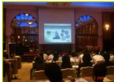
Summit Day 2