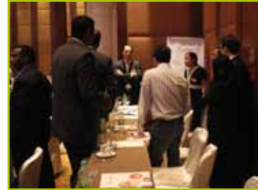
Breakout Group Discussion - Afternoon