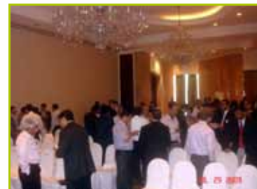
DAY 1 Networking Session