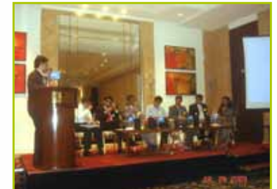
Panellists on Stage