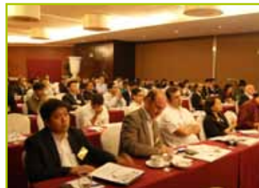
Summit Day 2