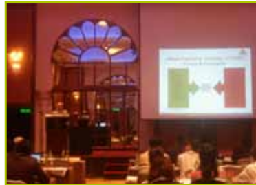
Stand Alone Presentation