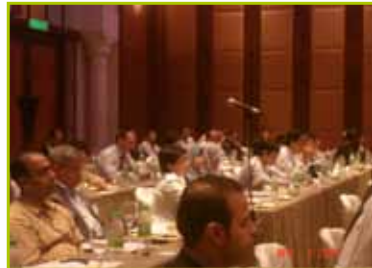
Summit Day 1