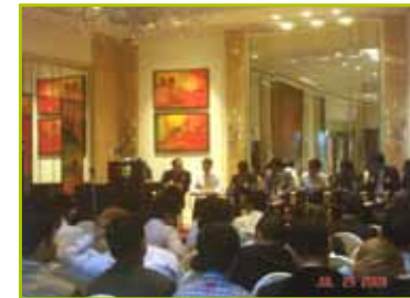
DAY 2 Panel Discussion